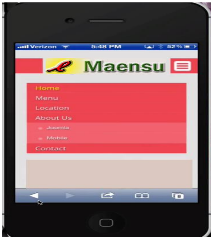
Figure 3: Sample Mobile Home Page